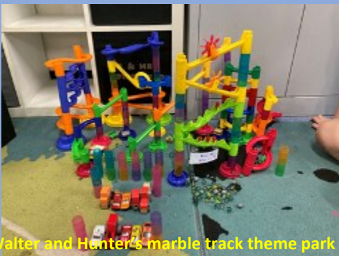
Walter and Hunter's marble track theme park