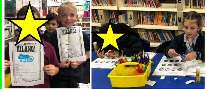
Grade 1 and 2 students completing sorting tasks and 'Binatang Hilang' posters.

During Term 3 and 4, students in Grade 1 and 2 have focussed on 'Binatang' (Animals). They have used their knowledge of numbers, colours and other simple adjectives to create sentences about animals, in particular, those that can be considered pets. These are referred to as, 'Binatang Kesayangan' (bin-a-tung ke-sigh-