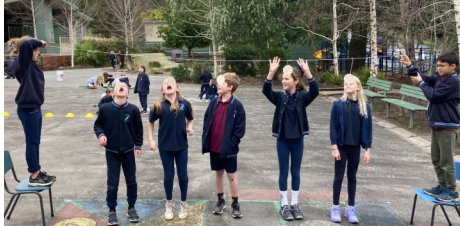
'Lomba Makan Kerupuk' is an eating competition that usually involves prawn crackers. We used rice cakes for our version.