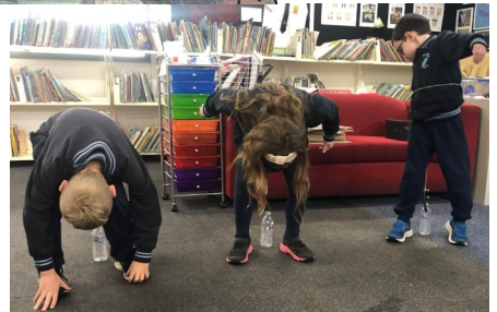
'Pena di Dalam Botol' (Pen in a Bottle), is another fun and challenging game played by children and adults alike during Independence Day celebrations.