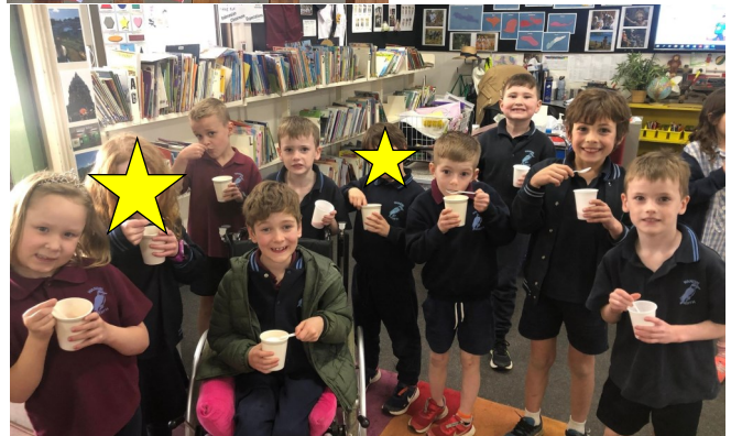
Our gorgeous Grade 1 students sampling Es Campur.