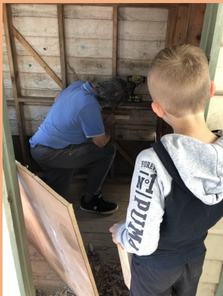
Diesel helping Amy's dad with the cubby house.