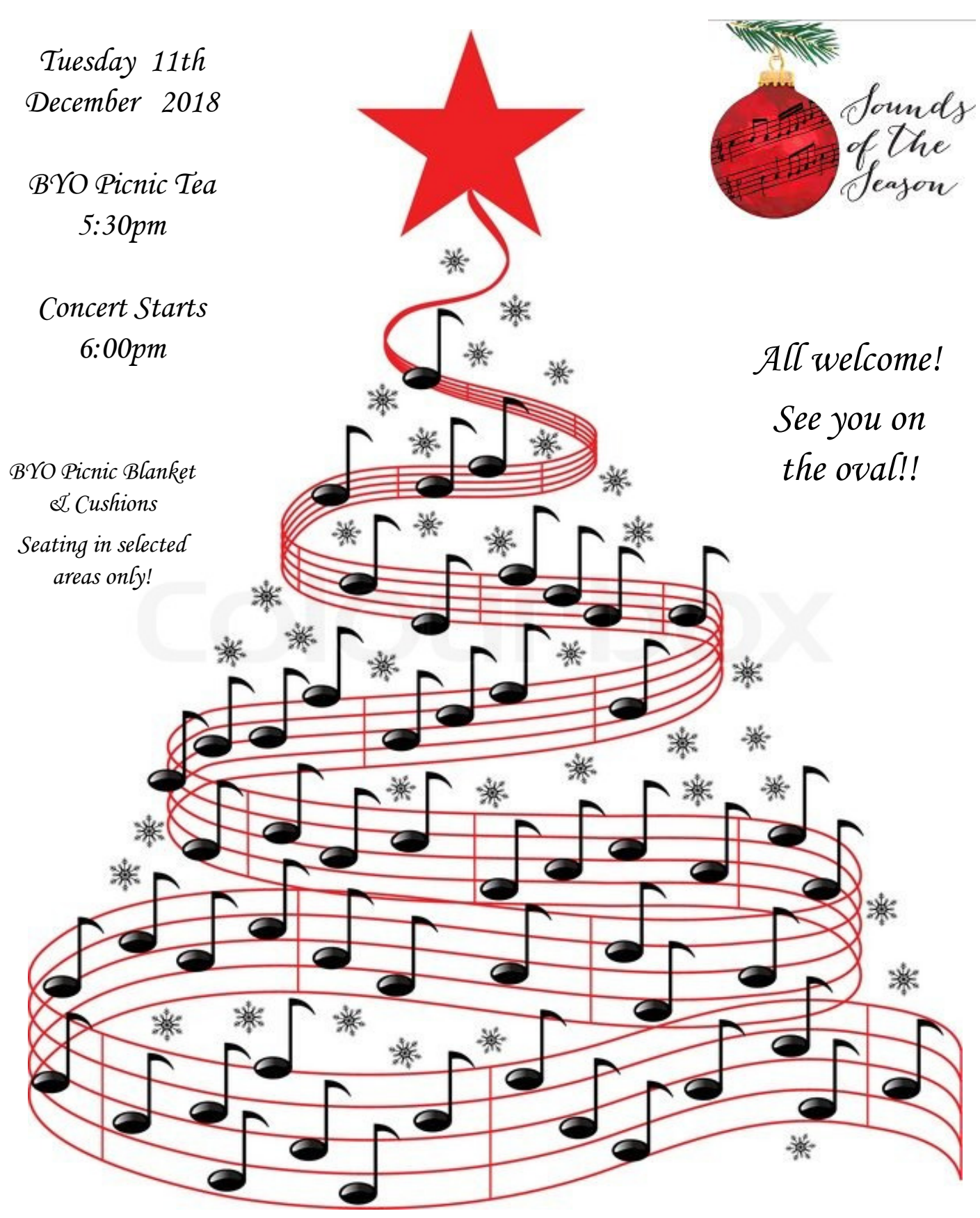
**** This is a pet-free, smoke-free and alcohol-free event! ****