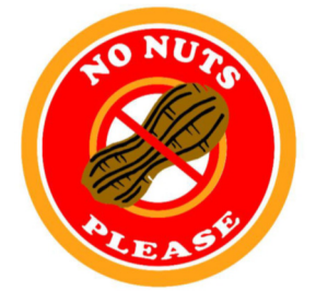
Some children at this school are allergic to nuts. We urge you to refrain from sending food containing nuts to school.

Smoking is NOT PERMITTED at any time on school grounds or the surrounding areas, including the car parks.