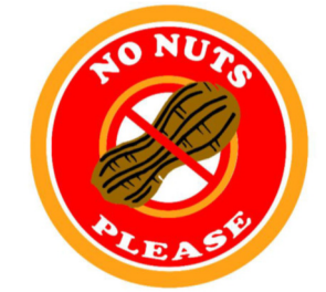
Some children at this school are allergic to nuts. We urge you to refrain from sending food containing nuts to school.

Smoking is NOT PERMITTED at any time on school grounds or the surrounding areas, including the car parks.