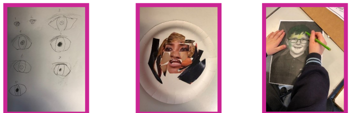
Drawings with Instructions