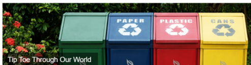
Tip Toe Through Our World

This Term, Grade 1-2 students will learn how to reduce, reuse and recycle as they consider the importance of sustainability. They will conduct an experiment to see how long things take to decompose. Students will also develop personal sustainability goals as they consider the ethics of sustainability.