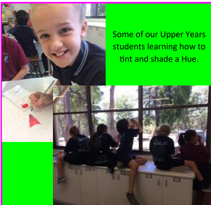
Some of our Upper Years students learning how to tint and shade a Hue.