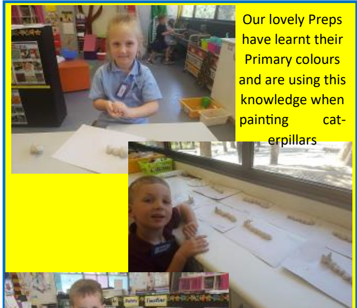
Our lovely Preps have learnt their Primary colours and are using this knowledge when painting caterpillars