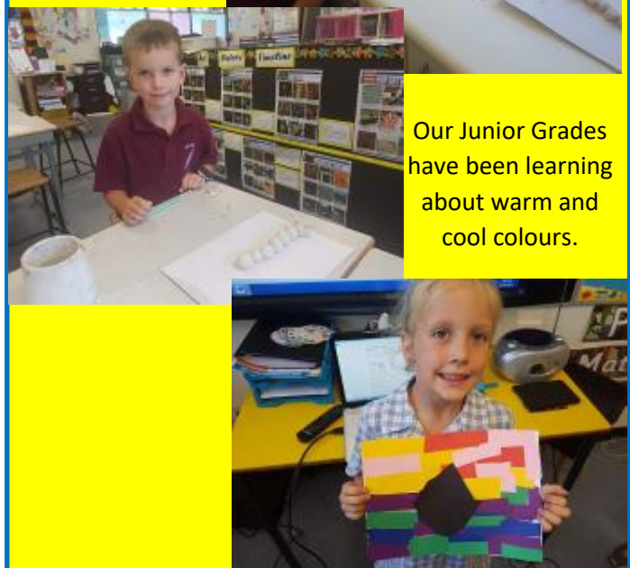
Our Junior Grades have been learning about warm and cool colours.